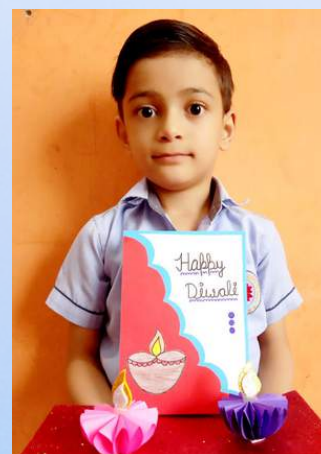
Aryan, II, Nalanda House

Diwali is a festival of lights. It is celebrated with great joy and happiness. The common theme of this festival includes lighting of diyas and gathering of families. Diyas symbolize goodness & purity & lightening them denotes dispelling darkness and going into light. Children of primary section are excited about showing their creativity and thus preparing diyas in advance.