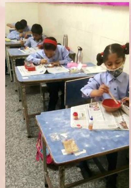
Students of class II