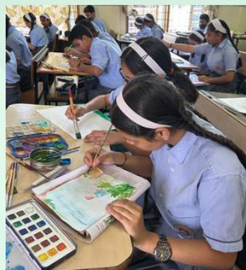
Millet drawing competition conducted in classes 9 to 12