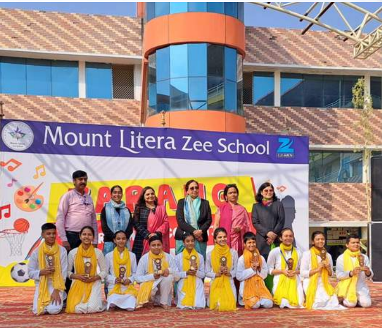
Students of Middle School bagged second position in Inter - School Group Singing Competition held at Mout Litera Zee School.