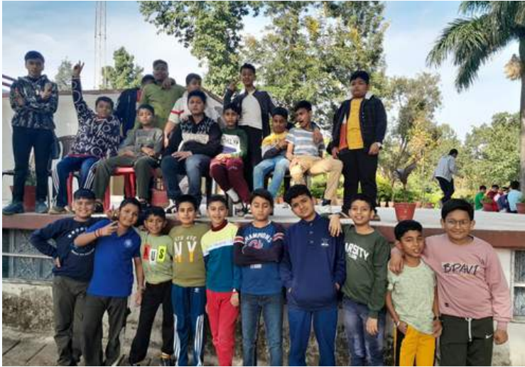
Students of Classes 6 & 7 went on two days excursion to Anghiala Hills to cherish mother nature closely.