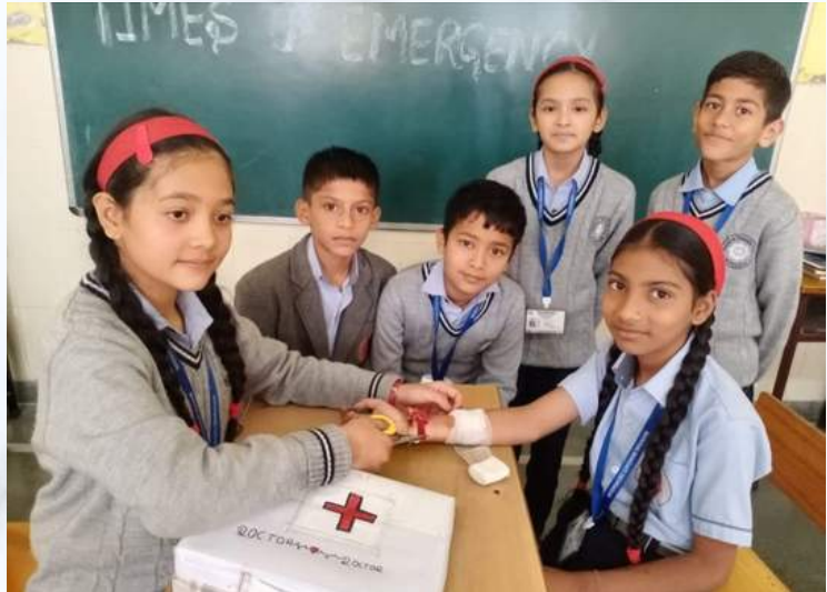
Students of Class 5A learnt about the importance of first aid through role play activity.