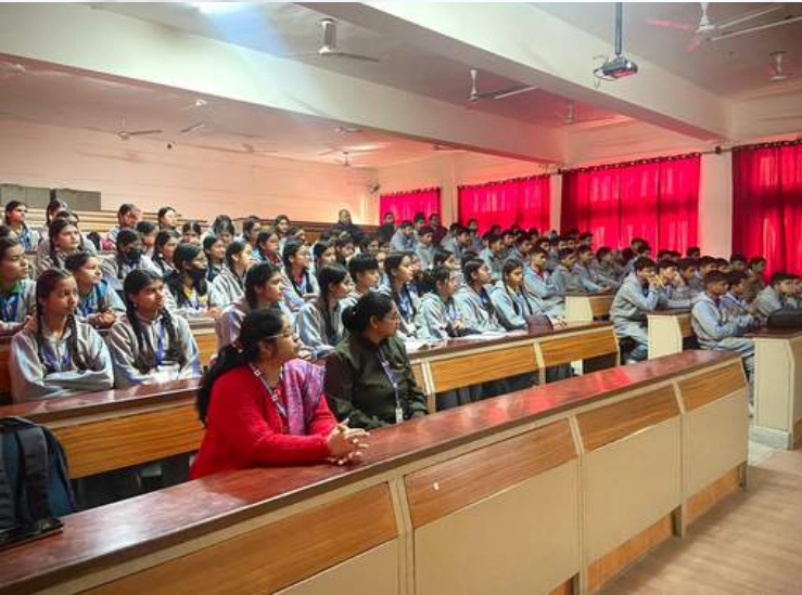
Students of Senior Wing attended an important career counselling session conducted at Swami Rama Himalayan University.