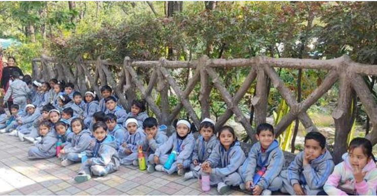
Students of Pre- primary wing went to Doon Zoo to learn about various fish , animals, birds and reptiles.